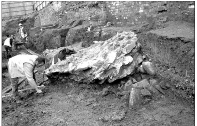
A section of the Roman town wall found west of Bath Lane.