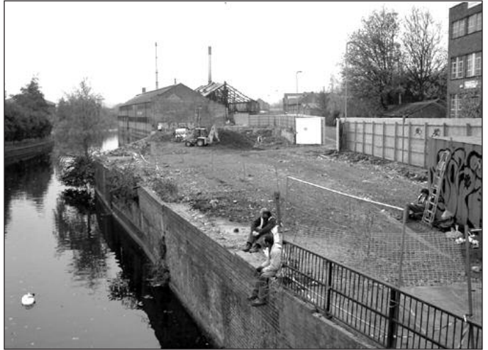
General view of the site in Bath Lane (behind the hoarding on the right) with the excavations taking place in the background.

Trial trenching evaluation in progress north of Vaughan Way has found evidence of a substantial Roman town house with a backfilled Roman cellar, column foundations for a portico and a small fragment of a tessellated pavement. Medieval burials have been located which are likely to be associated with the lost church of St Michael although no sign of the church itself has been found yet.