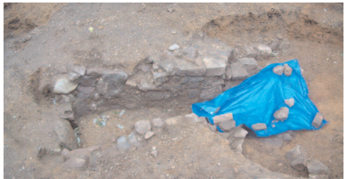
Malt kiln found on the site of the former St Margaret's baths.

PLEASE PAY YOUR SUBSCRIPTION BY BANKERS' ORDER AND ALSO GIFT AID YOUR SUBSCRIPTION – FORM ENCLOSED