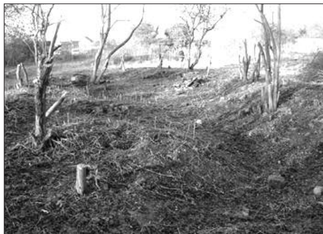
The site of Aldeby church looking west.