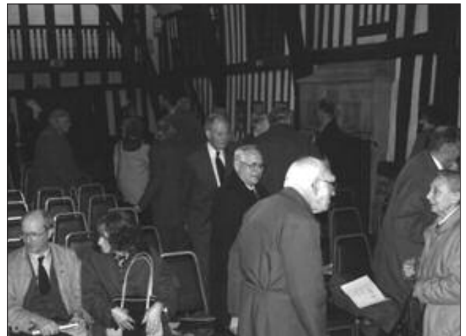
Above: Members at the AGM.