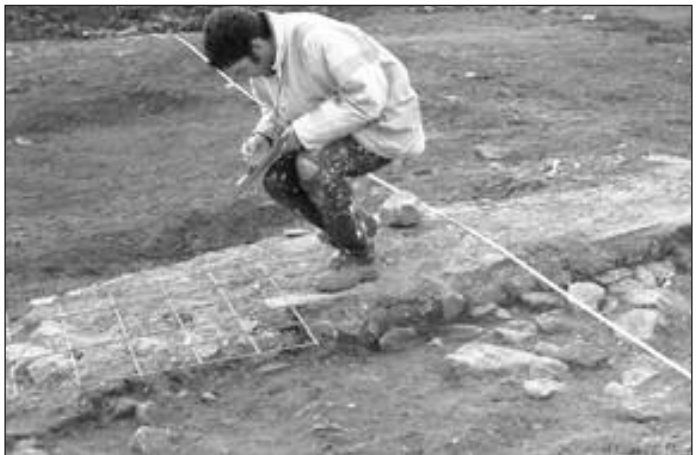
Top: General view across the St Nicholas Place site looking towards the Guildhall.