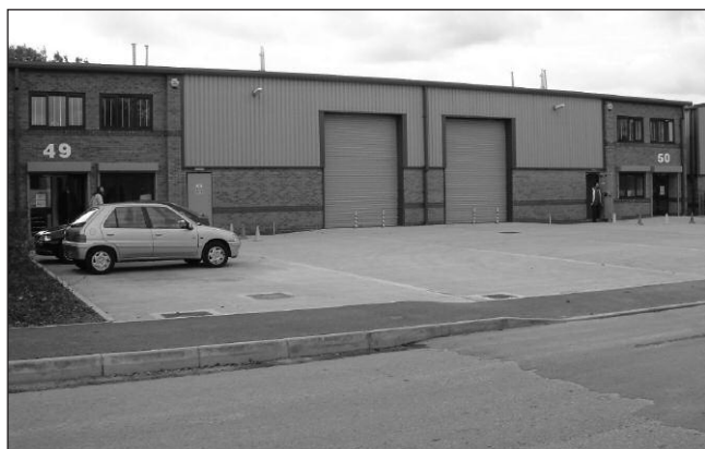
The Resources Centre at Barrow on Soar.

The secondary function of the Centre is to provide facilities for members of the public to view and study these collections. Two offices have been adapted for this purpose, with work desks and computer terminals to access the collections database. Intending visitors will be able to discuss their requirements with one of the curators, and make appointments to view the collections with the assistance of that curator.