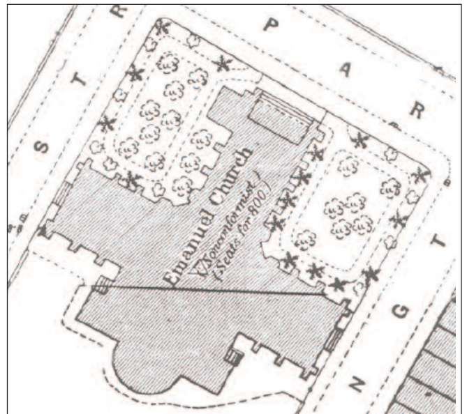
Top: The picture printed in the last edition of the Newsletter which was taken by the Honorary Secretary in the 1970s.

The Union Church closed in September 1939 and the main building became a store and workshop. From that time, the schoolroom (begun in 1889) was used as Emanuel Baptist Church until that too closed in 1973. After it ceased to function as a church, the main building saw a variety of uses: Brown's Blue buses were parked in the gardens and J E Goode, rag and scrap merchants, used the buildings. In the early 1970s demolition of the surrounding area took place and the church itself was destroyed by a fire on the night of October 12th 1978.