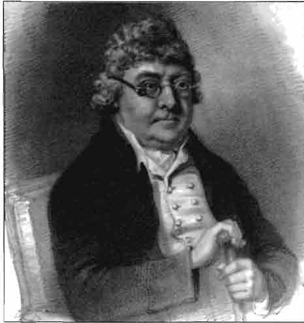
1. John Nichols FSA (1745-1826) printer, antiquary and editor of 'The History and Antiquities of Leicestershire'

The second point is the comparative ease by which he was able to call upon Leicestershire residents for assistance and the approbation with which his history was met. Although he complained that in the early stages it did not meet with the reception he had hoped for, the response of members of the Leicestershire landed elite would appear to have been positive. 2 After the fire of 1808 at his London printing offices in Red Lion Passage, over 250 gentlemen volunteered to double their subscription to five guineas on the remaining volumes, as a gesture towards indemnifying him for some of his losses incurred. 3 How should the support and enthusiasm for Nichols' 4,500 page venture be understood?