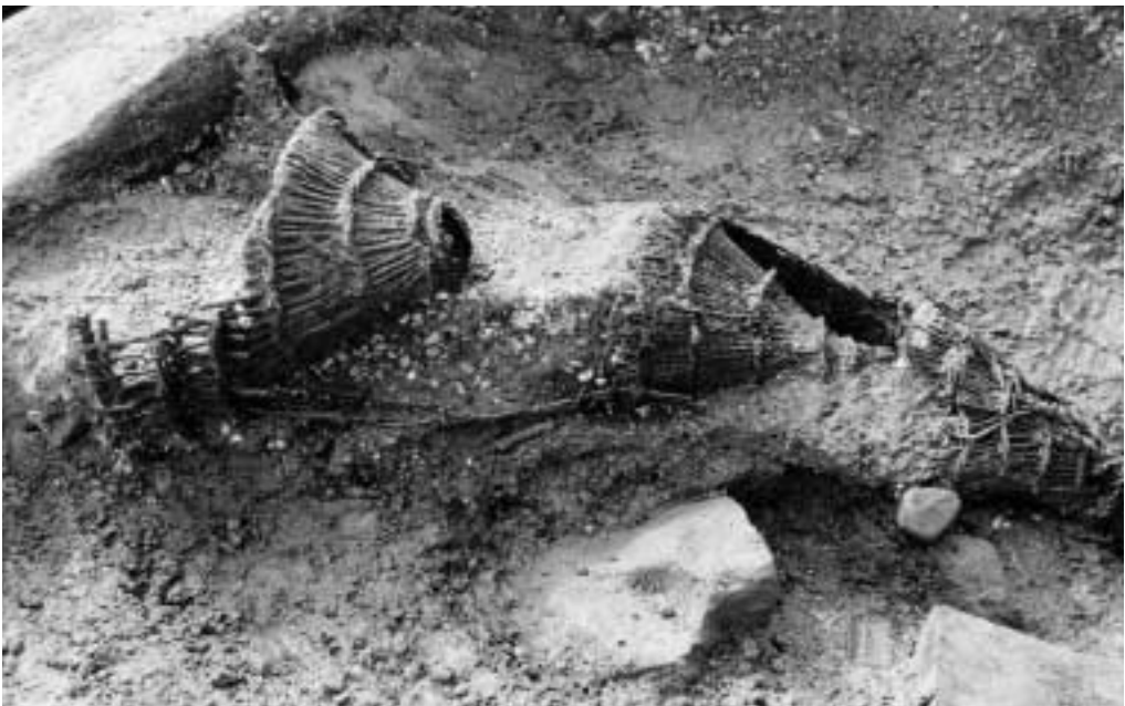
7: Wicker fish basket partly dismantled showing internal funnels