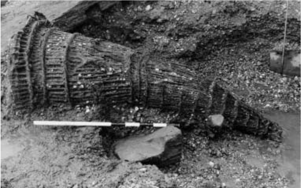
6: Wicker fish basket from HL12 (scale: 1m)