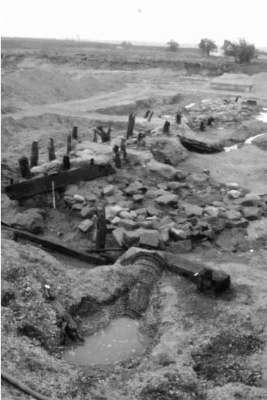
5: Structure HL12: the weir or dam with apex (centre) and partly exposed wicker fish trap in foreground. The conjectured river flow is top right to bottom left.