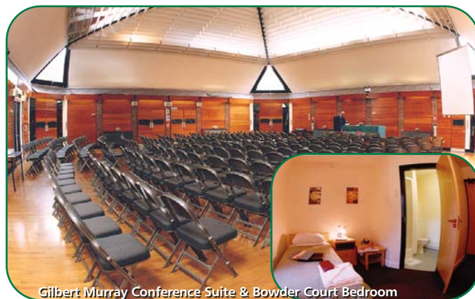
Gilbert Murray Conference Suite & Bowdler Court Bedroom

The compact site allows Gilbert Murray to be used in conjunction with adjacent halls, providing even greater choice for organisers.