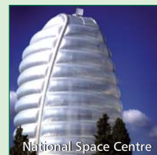
National Space Centre