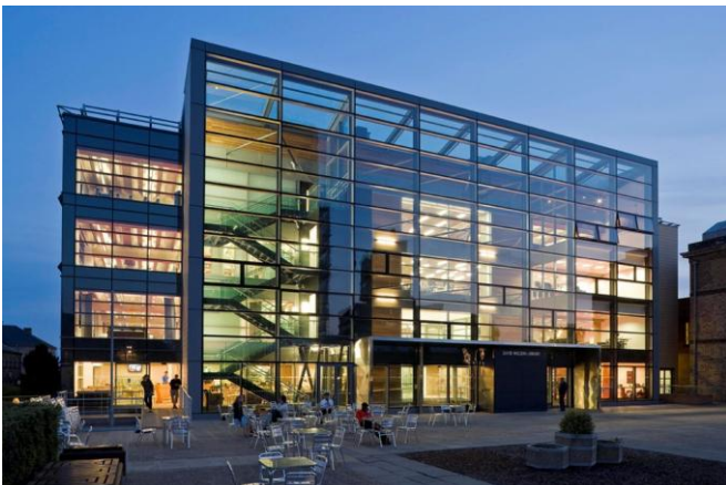
David Wilson Library, officially opened by Her Majesty the Queen in Dec 2008