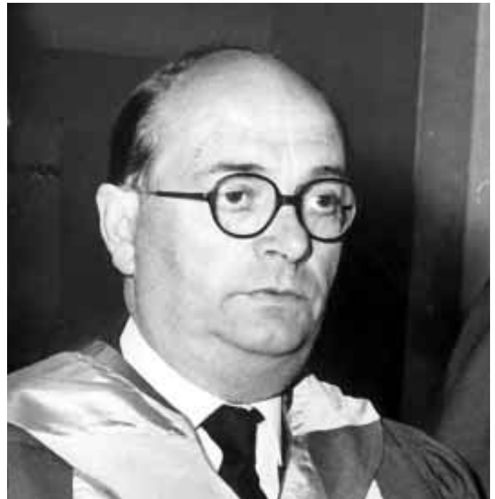
Sir John Harold Plumb

But his works remain a standard against which other books on similar topics must be judged. His life of Sir Robert Walpole is incomplete; it has been claimed that Jack Plumb had so far identified himself with his subject that he could not bring himself to write of a great man in decline. It has been suggested that it was not as radical a revision of the earlier biography – three volumes published by William Cox in 1798 – as might have been expected. However, it illustrates most